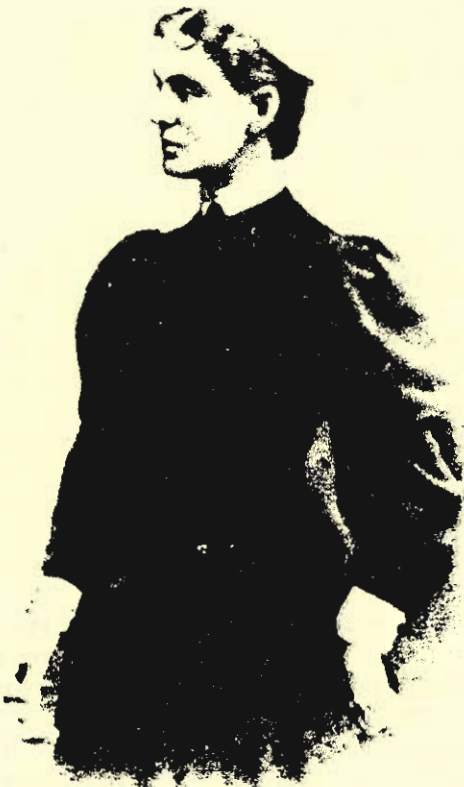
M. Adelaide Nutting

"Dear fellow-nurses, whatever you do after these various wars are over, do not, I earnestly beg of you, do not unite in 'Veterans of' this, that and the other part of any fray! ... Is there anything more lamentable than to see women, and nurses especially, imitating the vain rivalries of men, echoing their absurd war cries, showing the clan spirit and perpetuating the memory of feud and clash?... Surely women should now give men a new lead, not follow them in their old barbarous customs. A new lead, a new note, an independent stand, with a clearer, farther vision than fighting man has held." -Foreign Department, AJN. May, 1916; 16:8, p. 752.